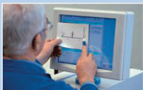
Folder's user-friendly "design as you go" touch screen.