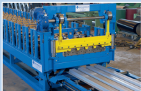
Cladding line to produce box profile for wall and roof panels.