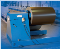
Decoiler (7 tonne) feeding steel coil into Rollform Line.